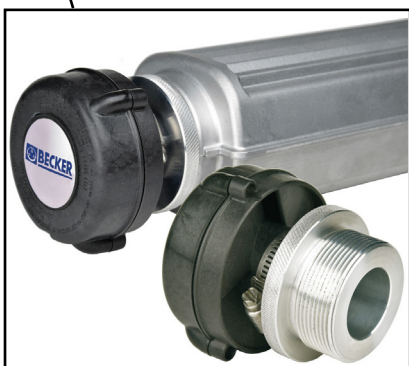
Part No. 74000600100A-BPC

Becker Reduces Dust, Becker Reduces Downtime!